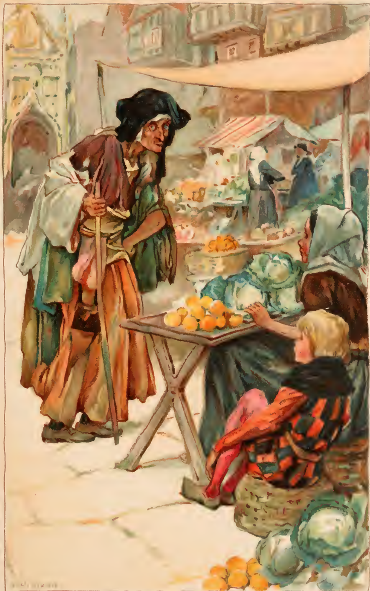
THE DWARF LONG-NOSE.

"An old woman came slowly across the market-place."